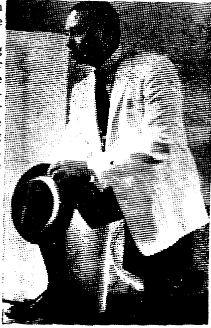
Jimmy Reed

The buckle-back slacks are really the rage of the College. With their tapered legs and unusual constructions, these comfortable slacks are just the thing to wear. The specialty of the shop is the British Charcoal flannel suit, which you can always find around the shop.